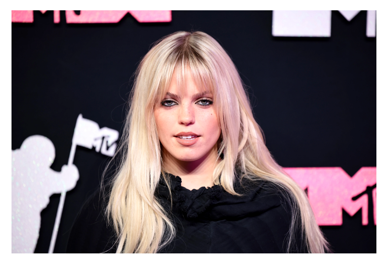
Renée Rap at 2023's VMAs red carpet.