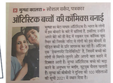
Dainik Bhaskar Hindi