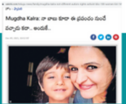
Sakshi TV Telugu