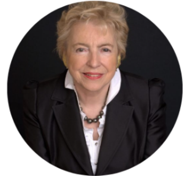
British IT pioneer, businesswoman and venture philanthropist