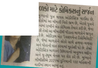
Dainik Bhaskar Gujarati